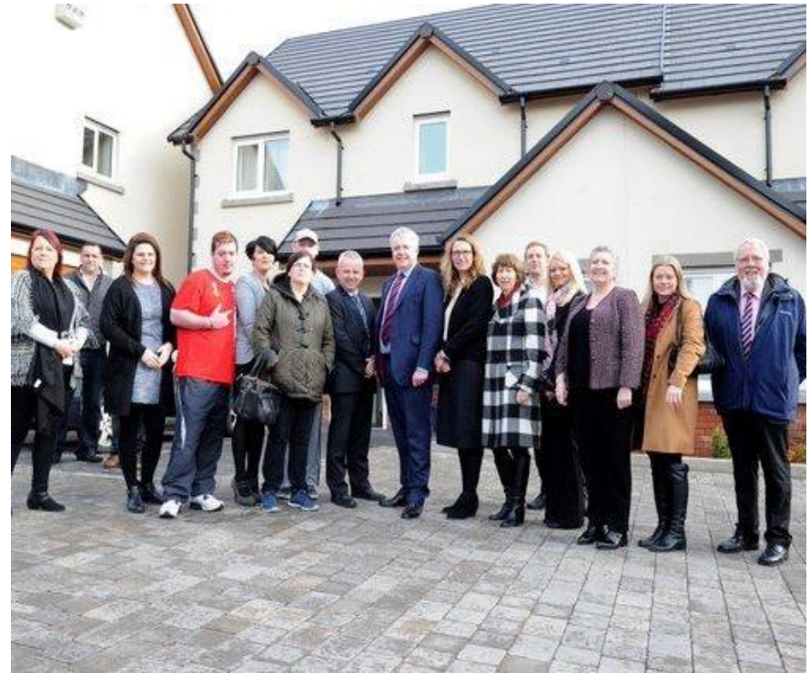
Skenfrith Court has given 5 people with complex needs the opportunity to live independently while providing 24 hour support on site