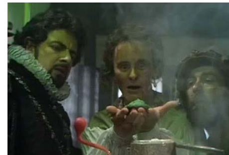
A Nugget of Purest Green