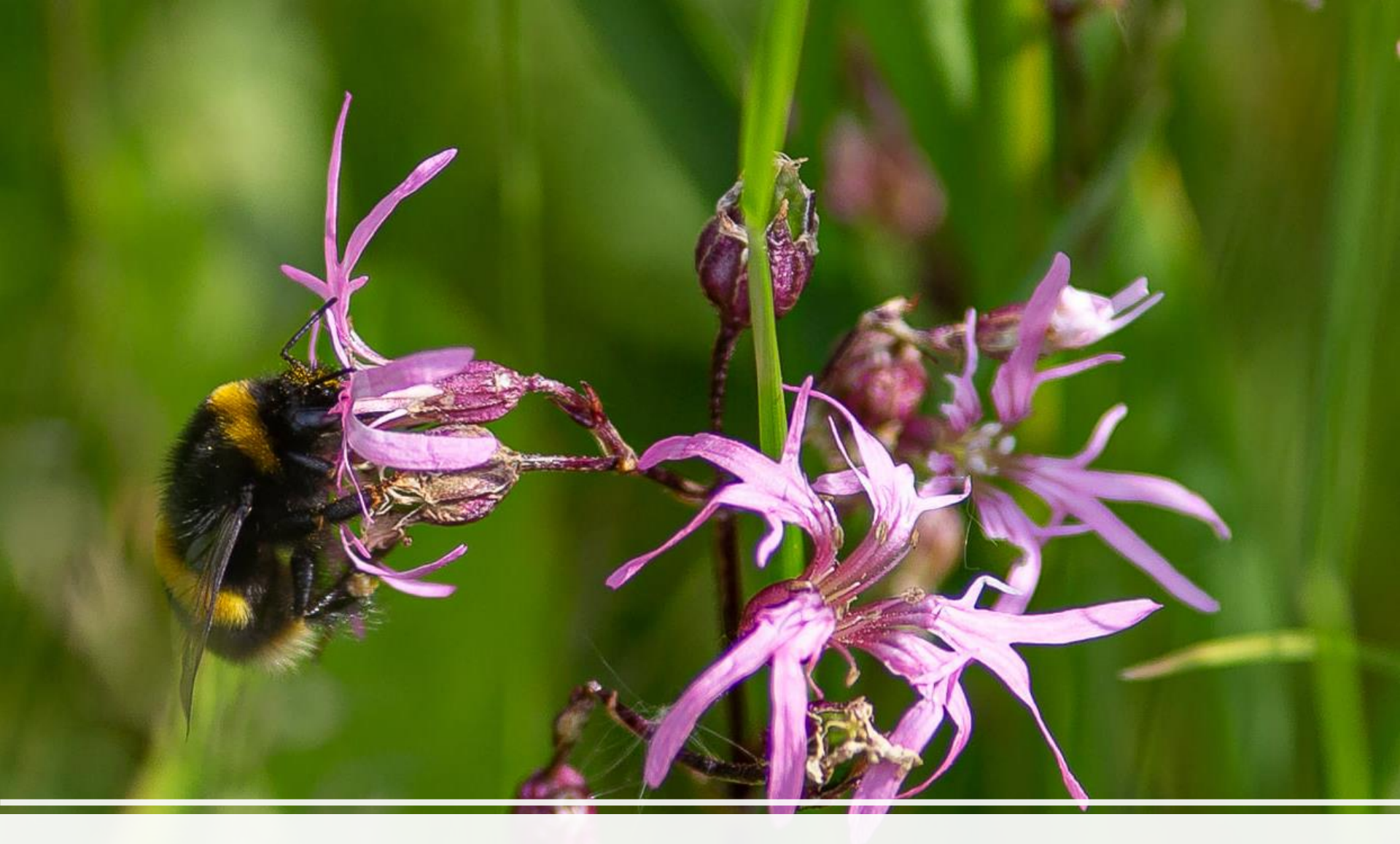
Local Places for Nature