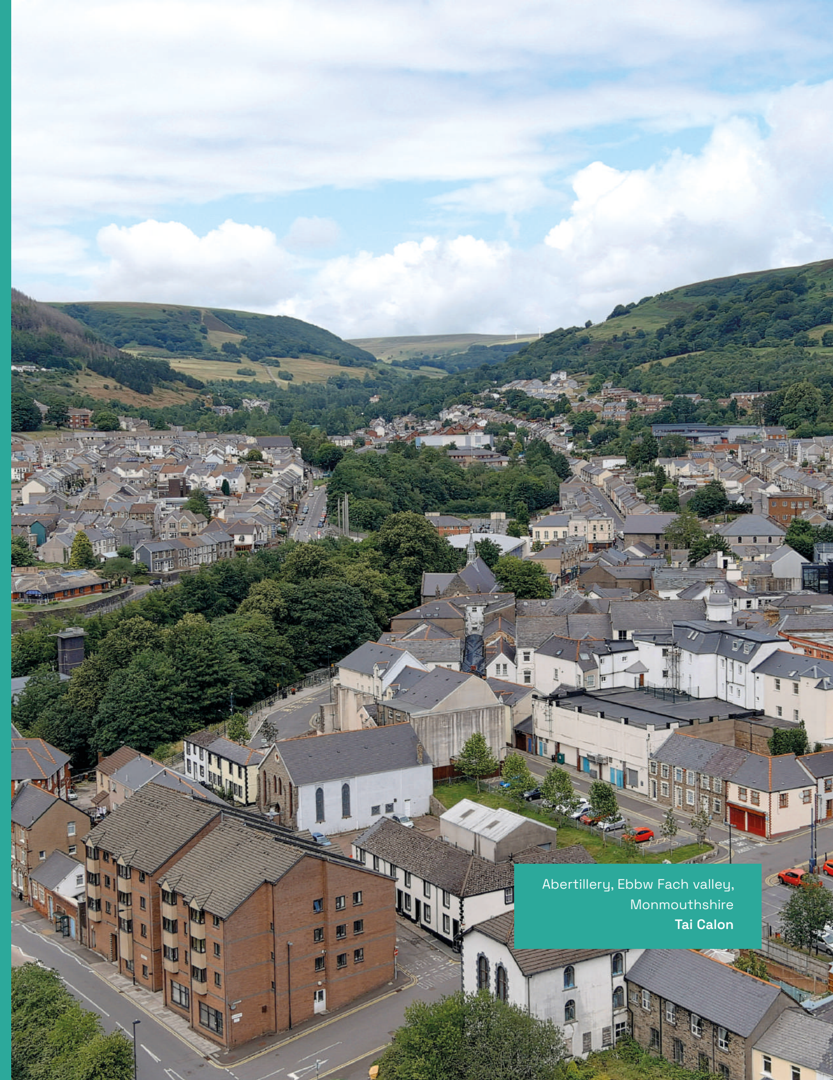
Abertillery, Ebbw Fach valley, Monmouthshire Tai Calon